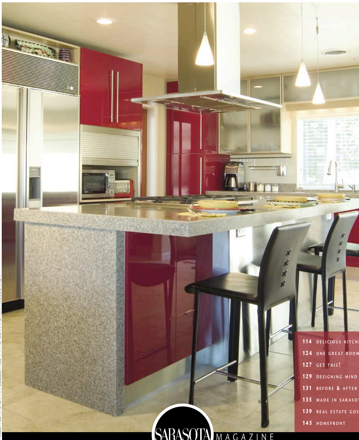
A SLEEK RED KITCHEN THAT SIZZLES. PAGE 114.